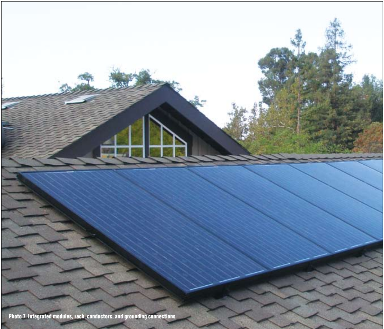
Photo 7. Integrated modules, rack, conductors, and grounding connections

This work was supported by the United States Department of Energy under Contract DE-FC 36-05-G015149