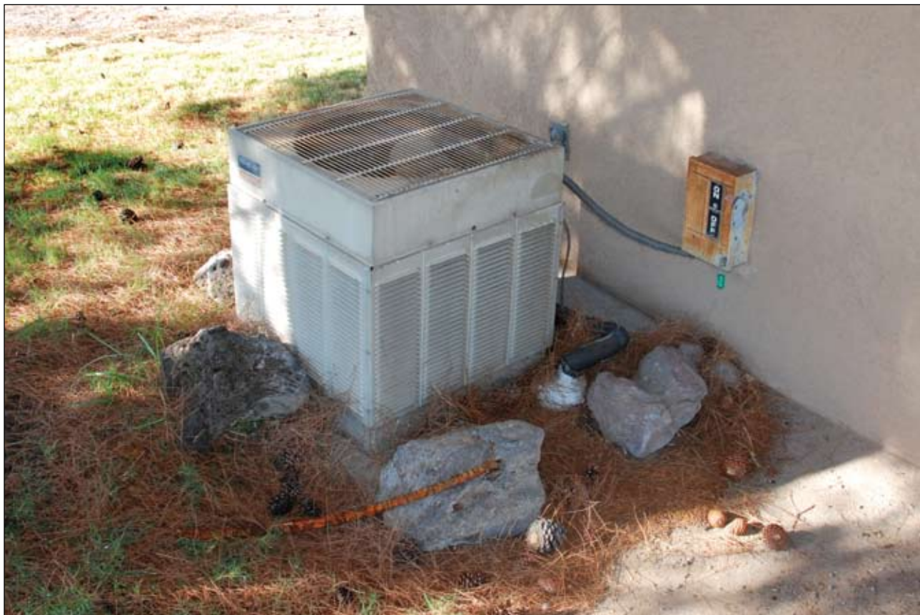
Photo 3. HVAC outside unit, well maintained and with single grounding point

used in the factory to bond the module frame sections together are evaluated during the listing process. However, the same level of scrutiny cannot be applied to field-installed, equipment-grounding methods, and the same parts and techniques used in the factory are generally not appropriate in the field.