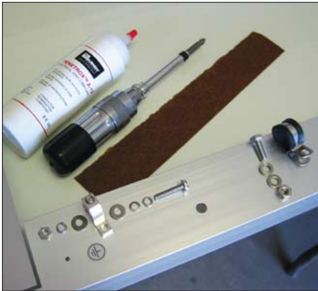
Photo 6. One module grounding method

spectors, electricians, electrical contractors, and PV professionals for a very nominal cost on an as-requested basis. A schedule of future presentations can be found on the IEE/SWTDI web site.✍