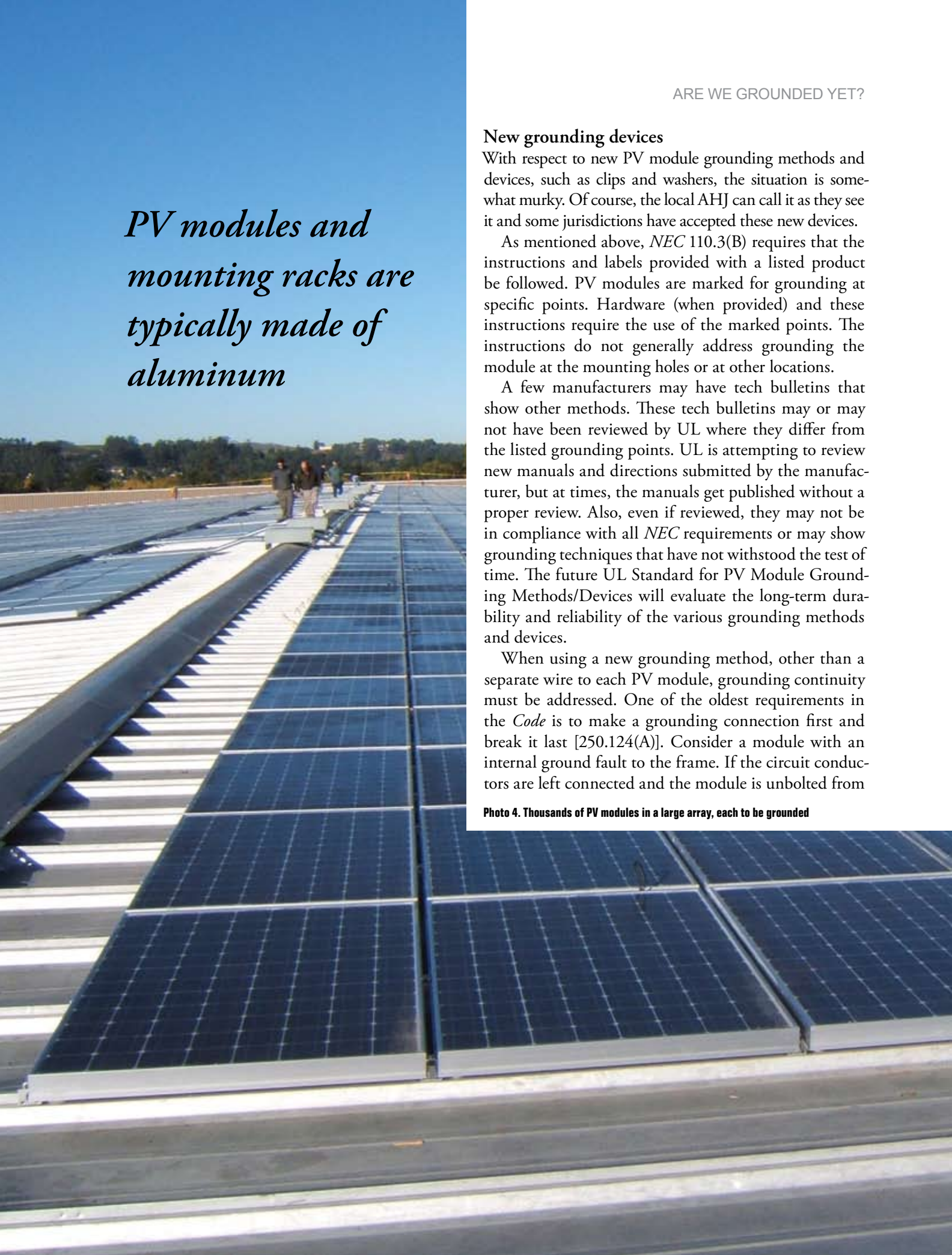
Photo 4. Thousands of PV modules in a large array, each to be grounded

When using a new grounding method, other than a separate wire to each PV module, grounding continuity must be addressed. One of the oldest requirements in the Code is to make a grounding connection first and break it last [250.124(A)]. Consider a module with an internal ground fault to the frame. If the circuit conductors are left connected and the module is unbolted from