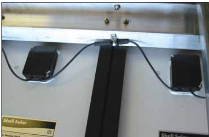
Photo 5. Module wiring properly secured

Yes, it might be possible to perform the above inspections in 15 minutes if the inspector has spent some time at the plan-check stage and is experienced in PV systems employing this inverter and the installer is there to answer questions, open the inverter and other equipment as necessary and to provide a ladder for roof access. However, any problems found in the above areas should warrant a closer look at the entire system; and when more details are examined, the inspection time can grow. A lack of familiarity with either PV in general, the equipment being installed, or the installer would normally dictate that the inspection take more time. How much? Some residential PV inspections for new inspectors are somewhat of a training session and with a knowledgeable installer, examining and discussing all of the details relating to a durable, safe (for 50 years) installation might take two or more hours.