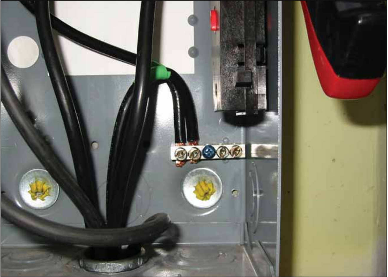
Photo 4. Properly installed, listed ground bar kit

Both circuit conductors (positive and negative) should be routed through the disconnect enclosure even though only the ungrounded conductor is switched. Avoiding a “switch loop” configuration ensures that both circuit conductors are always in close proximity for best functioning of overcurrent devices and to allow a bolted connection point for the grounded conductor on an isolated “neutral bus” in the enclosure, if required.