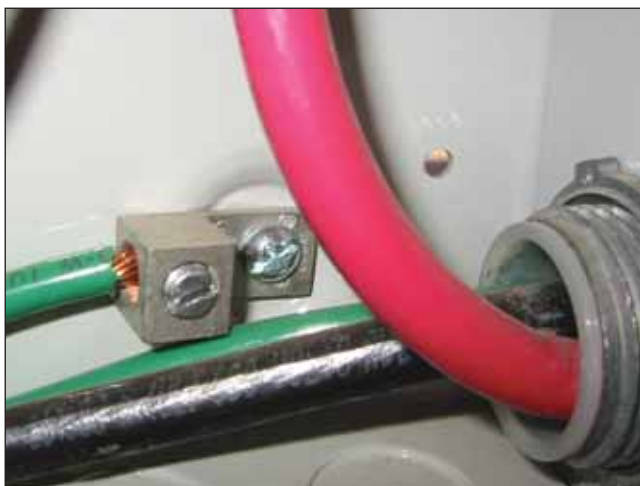
Photo 3. Improperly grounded dc disconnect; violates 250.8, 110.3(3), 250.96(A), and 250.4(A)(5)

Each disconnect should be properly grounded. Following and verifying the equipment grounding conductors backwards from the ac load center through the system to the PV modules is important to ensure that each ex-