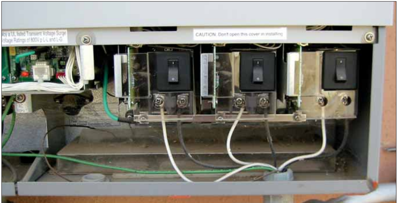
Photo 2. Inverter with three DC inputs

because such a connection would establish a connection between ground and the neutral conductor that is prohibited by NEC Section 250.6 and 250.24(A)(5).