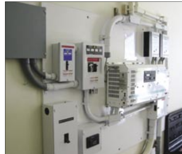
Photo 6. Off-grid PV power system

PV systems have had ac outputs up to 30 kW! These residential-sized inverters interface with the grid at 120 volts or 240 volts, are listed to UL Standard 1741, and have all of the necessary safety equipment built in and verified as part of the listing process. The inverters inherently meet NEC 690.5 ground-fault protection equipment requirements (fire protection) for use with PV arrays mounted on the roofs of dwellings.