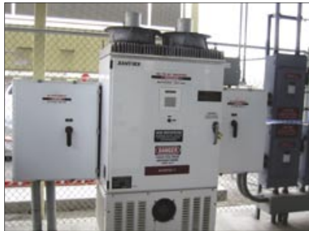
Photo 2. The 200 kW inverter associated with the larger 200 kW PV array