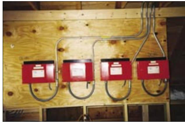
Photo 7. Four 2.5 kW inverters used on a 10 kW utility-interactive residential PV system.