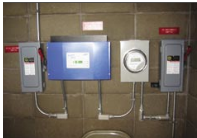
Photo 3. The 2.5 kW inverter associated with the smaller 2 kW PV array

portions of the system coupled with the alternating current (ac) interconnection to the utility grid make PV installations somewhat unique. Because the PV industry is thriving and growing rapidly, individuals, companies, and organizations with varying degrees of knowledge, skill, and experience are installing these systems. Large (and some small) PV systems integrators and vendors working with experienced electrical contractors who have jointly pursued additional PV-specific training and who work closely with the local permitting and inspecting authorities usually (but not always) perform the best, most Code -compliant installations.