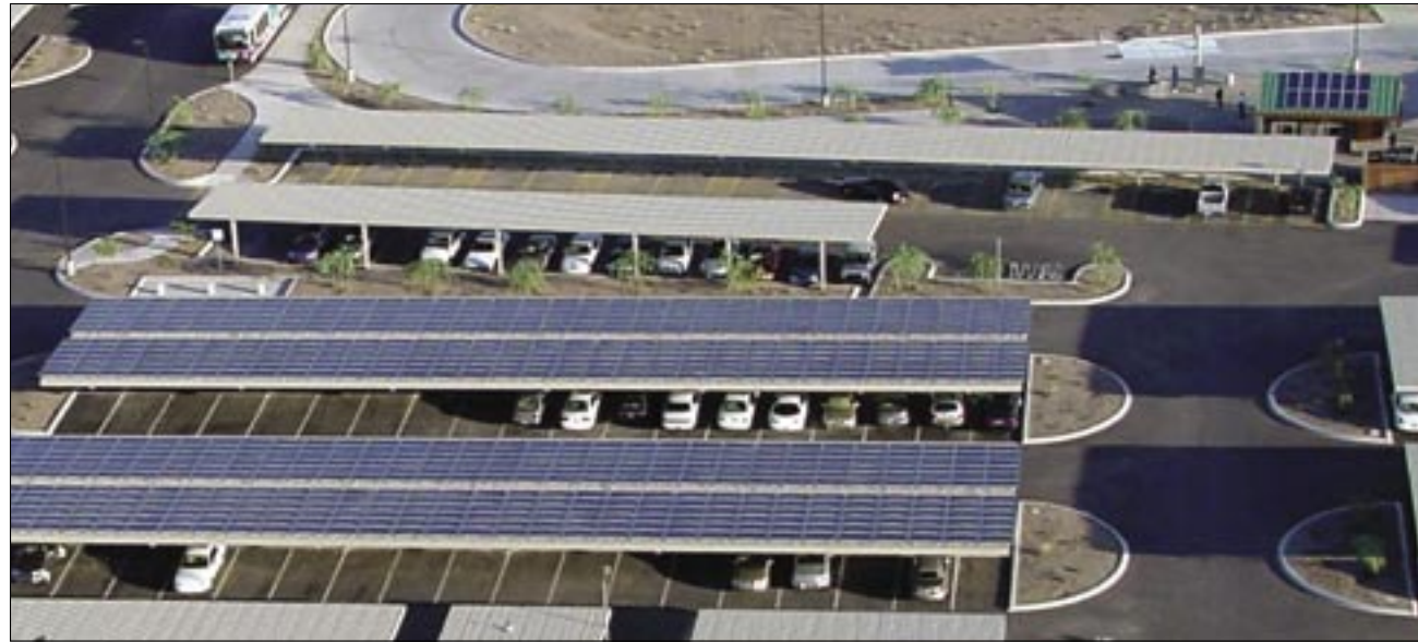
Photo 1. This aerial view of two PV systems at the Salt River Project (SRP) Park and Ride in Phoenix, AZ shows a 200 kW utility-interactive system mounted on the shading roof of a parking structure in the left center and a 2 kW utility-interactive PV system mounted on the roof of a small building in the upper right. PV modules are blue in color.