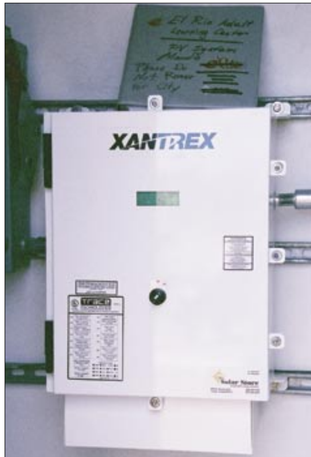
Photo 8. 15 kW 3-phase utility-interactive inverter

percent from nominal or when the frequency varies by more than a few hertz from the normal 60 Hz. Many PV owners in California were surprised when their utility-interactive PV systems did not work during the rolling utility blackouts and brownouts a few years ago. Utility-interactive PV systems with battery backup were popular for months following the blackouts.