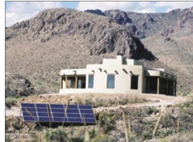
Photo 5. Off-grid home with 3.6 kW PV array

Utility-interactive PV systems are by far the most numerous of the types of PV systems being installed. A typical residential system might have a PV array and an inverter (converts dc to ac) capable of delivering 2500 watts of ac power to either ac loads in the house or to the utility grid when the power output is in excess of those local loads. In residential PV systems, single and multiple inverter installations are common. The single inverter may have an ac output rating of 700 to 3500 watts, and systems are frequently seen with 2–4 inverters used to increase the system power output (see photo 7, on page 14). Residential