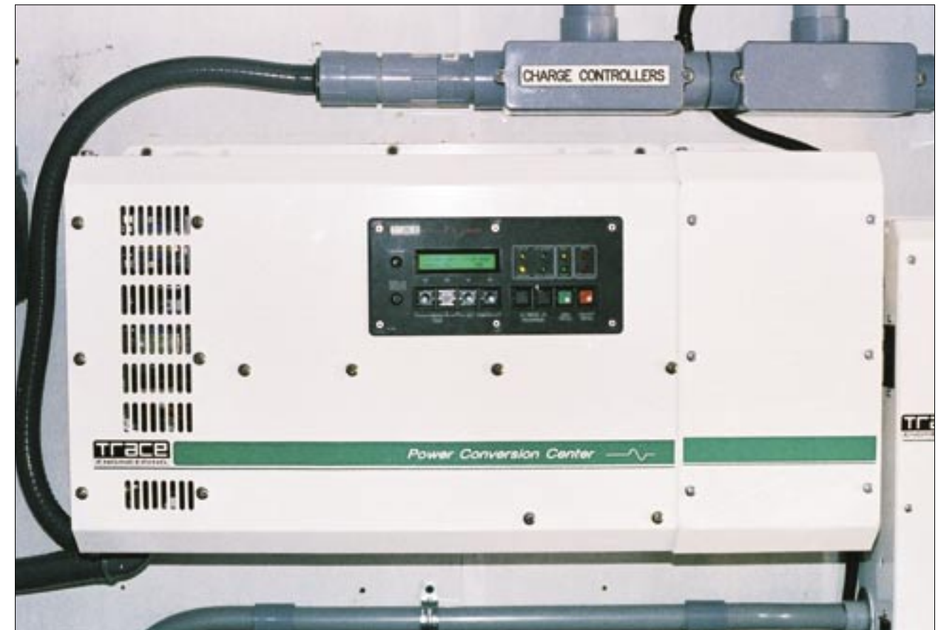
Photo 9. 4 kW stand-alone inverter

Ampacity calculations for the circuits from the PV modules are based on the rated short-circuit current marked on the back of each module. The PV module is a current-limited source, and this rated short-circuit