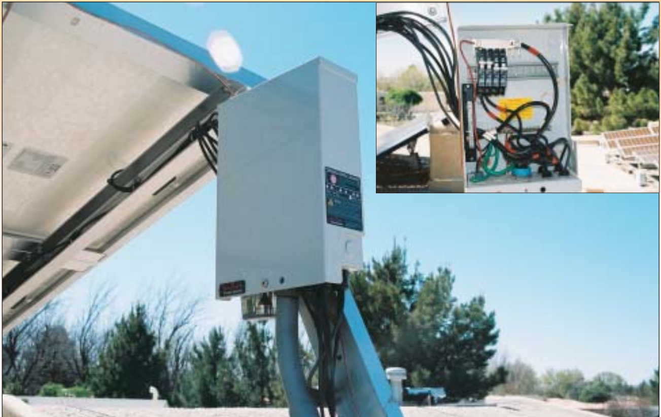
Photos 5 and 5A. PV combiner with circuit breakers