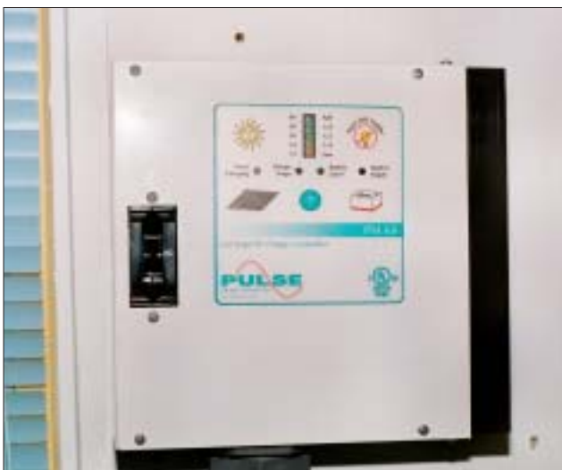
Photo 7. 60 A PV charge controller

Stand-alone systems and utility-interactive (U-I) systems with battery banks will also have charge controllers that regulate the state-of-charge to the battery