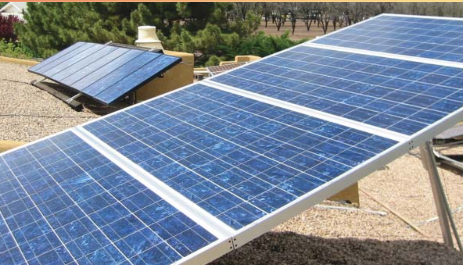
Photo 1. Framed PV modules

Stalking the Elusive and Somewhat Strange PV System