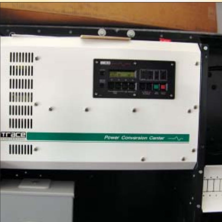
Photo 9. Stand-alone 4 kW inverter

10, and 11). Unfortunately installation manuals for these complex inverters (particularly the stand-alone types) can be several hundred pages long. The inspector should verify the proper dc and ac conductor sizes and overcurrent protection. Both are based on the rated ac power output of the inverter. [See 690.8 and 690.9 in the NEC Handbook .]