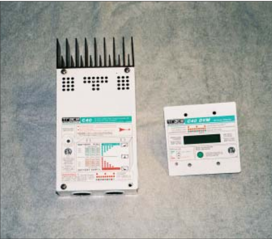
Photo 6. 40 A PV charge controller with remote display

bars in these units that pose shock hazards. It may seem strange, but these enclosures containing normally user-serviceable items like fuses and circuit breakers are not required to have a dead-front interior panel.