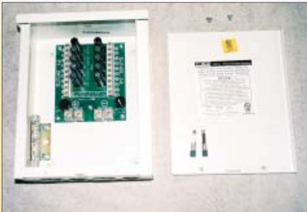
Photo 4. PV combiner with fuses

tain the overcurrent devices (fuses or circuit breakers) that are required to protect the module interconnecting conductors from fault currents and the individual modules from reverse currents. The reverse currents may originate from parallel-connected strings of modules, from reverse currents from the batteries in a system that has them, or from backfeed currents from a utility-interactive inverter. The ratings of the overcurrent devices must be consistent with the ampacity of the conductors connecting the modules and the maximum series fuse marked on the back of the module. The combiner might be viewed as a branch circuit load center connected in reverse acting like a PV source panel. The overcurrent devices in this enclosure are located in the proper place in the PV circuits to meet NEC and UL requirements. Most of these enclosures are white since they may be exposed to sunlight and white minimizes the internal temperature rise (see photos 4 and 5). Inspectors should check for screw-cover enclosures and warning labels if the combiner contains circuit breakers or fuses and has internal, exposed, energized terminals. Several units have been listed with no external labels warning that there are no user serviceable parts inside. UL Standard 1741 will be changed to reflect the requirement for such warning labels because there are internal, exposed bus-