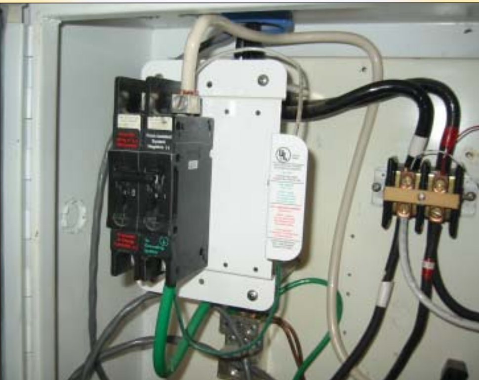
Photo 12. Stand-alone PV ground-fault protection device

Yes, during a ground fault, the dc bonding connection is opened, and if the ground fault cures itself for some reason, the dc system remains ungrounded until the system is reset. A positive-to-ground fault may allow the negative conductor (now ungrounded) to go to the open-circuit voltage with respect to ground. This is addressed by the marking requirements of 690.5(C). A very high value resistance is usually built into the GFPD and this resistance bleeds off static electric charges and keeps the PV system loosely referenced to ground (but not solidly grounded) during ground-