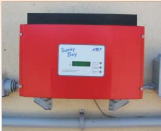
Photo 10. Utility-interactive 2.5 kW inverter

The last, somewhat unique, piece of equipment found in PV systems is the NEC 690.5 required ground-fault protection device.