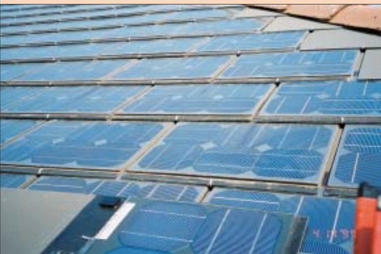
Photo 2. PV modules as roofing material

frames or with no frames. Others will be used as roofing materials (photo 2) or laminated directly to standing seam metal roofs (photo 3). PV modules come in many sizes and shapes. The inspector needs to determine the listing of the modules and the electrical ratings. These are usually printed on the back of the module or are available in the instruction manual. Some unlisted, custom modules are being installed in architect-designed projects and it is the inspector's call as to whether they meet Code requirements. Although appearances may differ, these PV modules all produce electricity when illuminated and the normal cautions associated with any electrical power system should be followed. PV modules come in differing power and voltage ratings. They must be connected in a manner that produces the needed voltage, current, and power since the output of a single module is usually not sufficient.