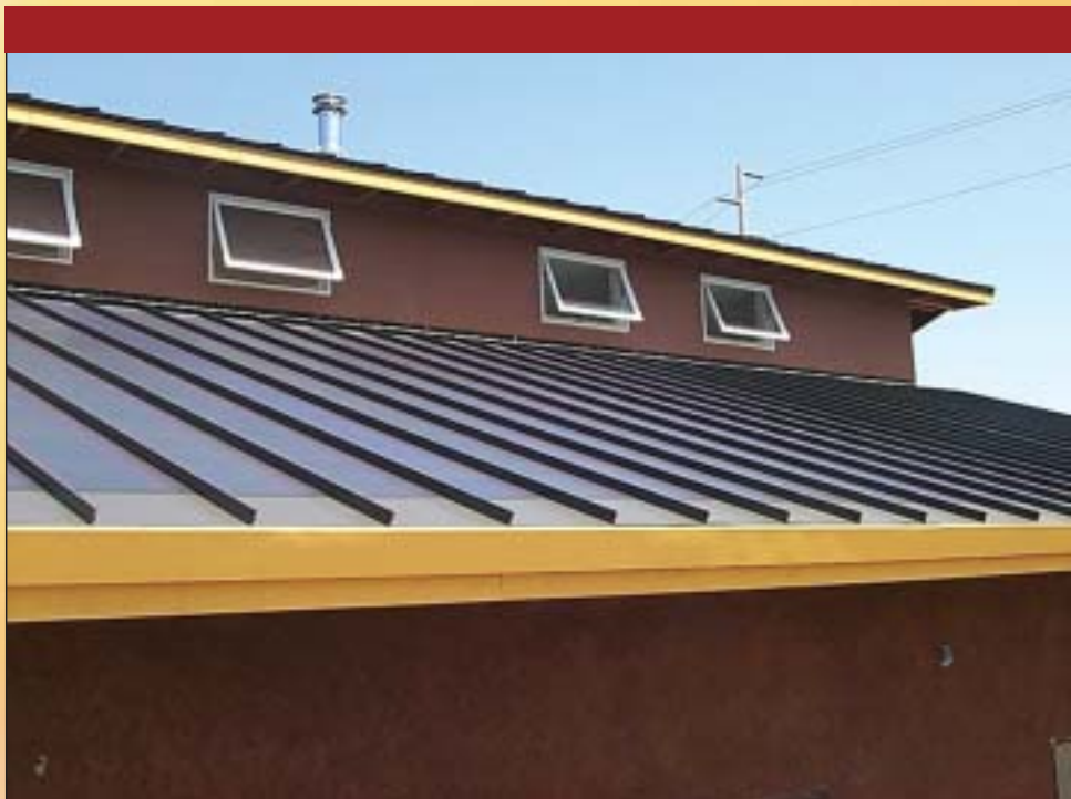
Photo 3. PV modules laminated to metal roof

The first things the inspector sees are the PV modules. While most of them have glass fronts, aluminum frames (colored mill-finish aluminum or anodized brown or black (photo 1) and plastic backs, some will be made with plastic