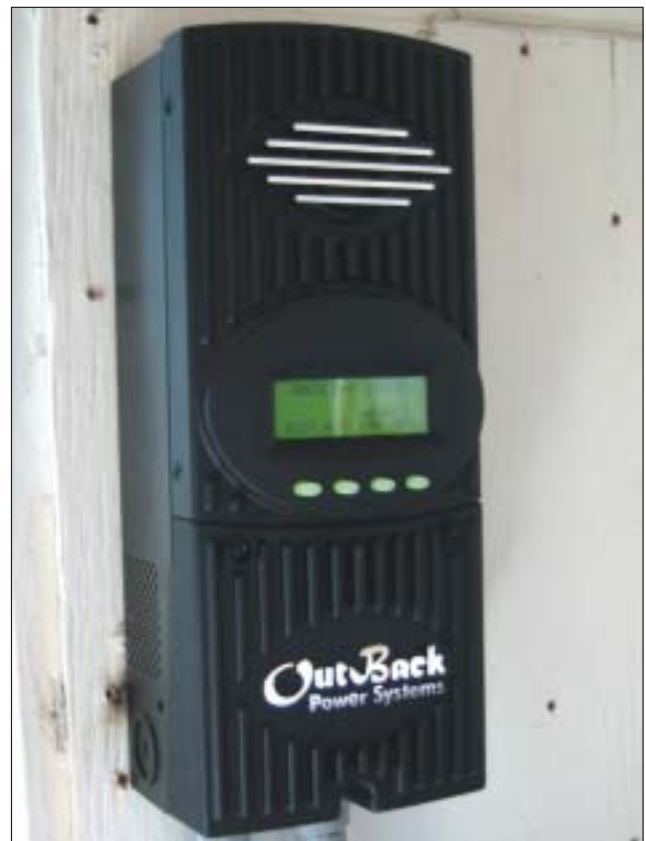
Photo 8. 60 A max power tracking PV charge controller

Inverters are found in both stand-alone systems and U-I systems. They essentially convert direct current (dc) energy from the PV system (and the dc energy stored in batteries) to alternating current (ac) energy for use by local loads or for feeding into the utility system. Some U-I inverters have the capability to power standby load circuits from batteries when the utility is down (see photos 9,