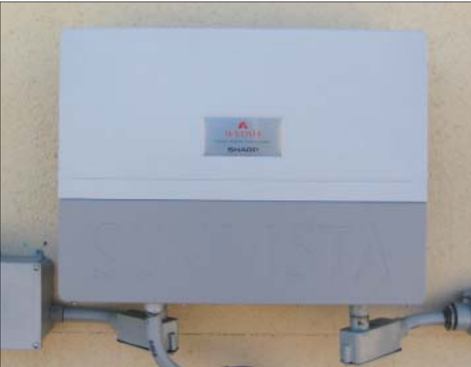
Photo 11. Utility-interactive 3.5 kW inverter

faults involving the negative conductor (a grounded conductor), the fault creates unwanted parallel paths for the negative currents and the fault currents will also flow through the dc bonding connection. The diagram in figure 1 shows both positive (red) and negative (blue) ground faults and the paths that the fault currents take. As noted above, all ground-fault currents must pass through the dc bonding connection where the GFPD sensing device is located.