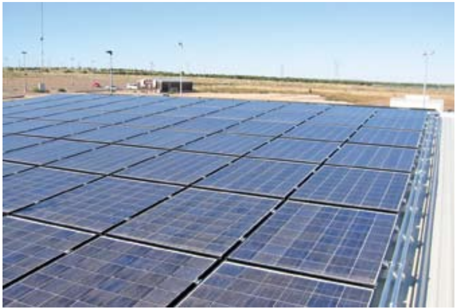
This 30 KW PV system requires a supply-side utility connection.

The connection of a utility-interactive inverter to the supply side of a service disconnect is essentially connecting a second service-entrance disconnect to the existing service. Many, if not all, of the rules for service-entrance equipment must be followed.