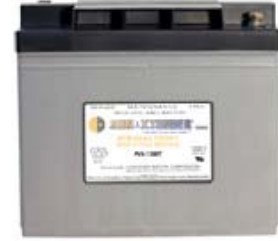
Enlarge Solar Battery

Battery Outline Drawings (PDF) Battery Sizing Tips (PDF) Click For Printable Page