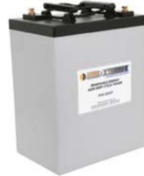
Enlarge Solar Battery

Battery Outline Drawings (PDF) Battery Sizing Tips (PDF) Click For Printable Page