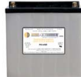
Enlarge Solar Battery

Battery Outline Drawings (PDF) Battery Sizing Tips (PDF) Click For Printable Page