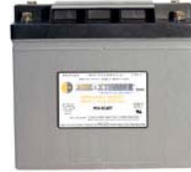
Enlarge Solar Battery

Battery Outline Drawings (PDF) Battery Sizing Tips (PDF) Click For Printable Page