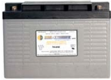
Enlarge Solar Battery

Battery Outline Drawings (PDF) Battery Sizing Tips (PDF) Click For Printable Page